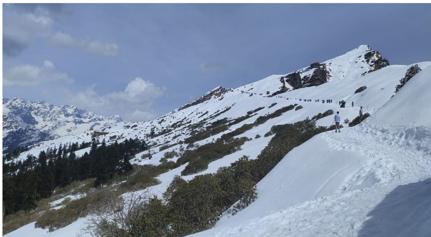
Glimpse of Chopta-Tungnath Trekking Route, During Early Winter

Those who are interested may please fill this form- https://forms.gle/uSWTpt9474KGAWFC8