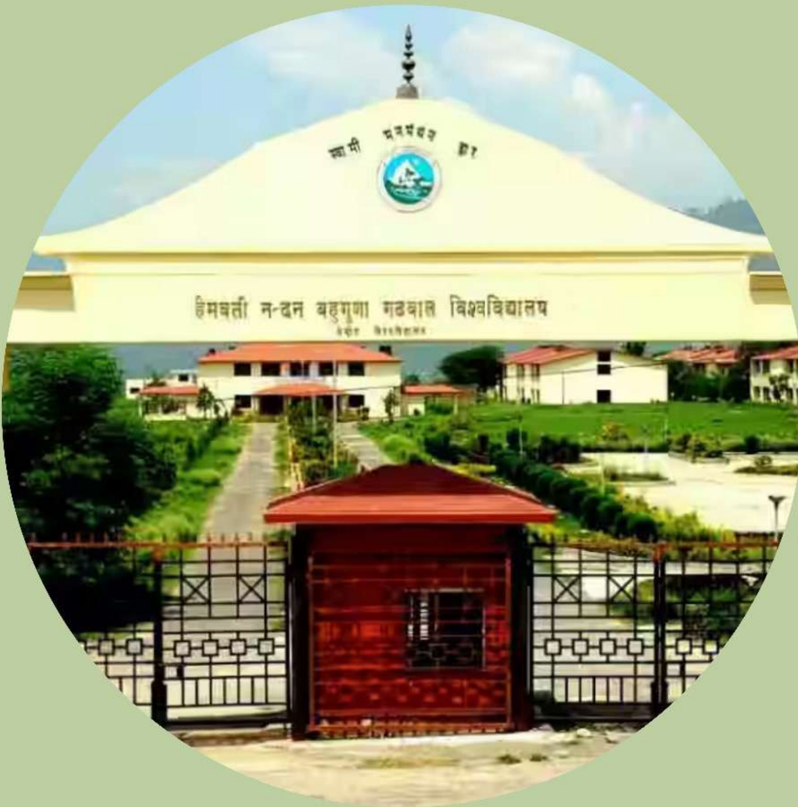
हेमवती नन्दन बहुगुणा गढ़वाल विश्वविद्यालय (केन्द्रीय विश्वविद्यालय) श्रीनगर (गढ़वाल), उत्तराखण्ड (भारत) Hemvati Nandan Bahuguna Garhwal University (A Central University) Srinagar (Garhwal), Uttarakhand (India)